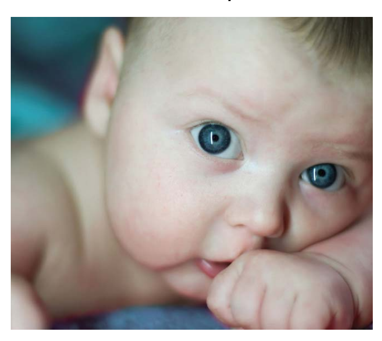
Revised July 2012

Under Part C of the Individuals with Disabilities Education Improvement Act